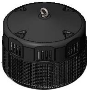
Hook Mount (Standard)