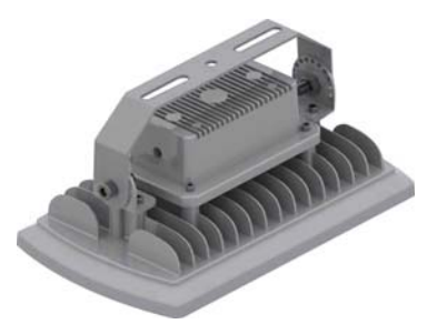
Adjustable Yoke Mount