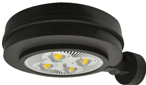
Adjustable Wall Mount