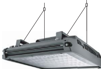
Supplied with Gripple Hangers (GPPL)