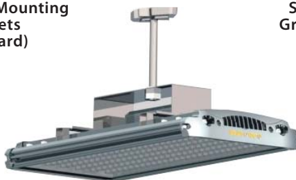
Pendant Mount 3/4" K.O. (PDM)