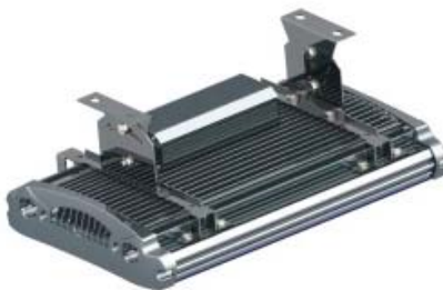
Adjustable Mounting Brackets (Standard)