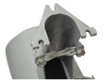
(Hardware Not included)