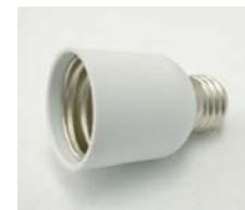
EXTENDER: E40-E26 Mogul to Medium Base Adapter ** ORDER SEPERATELY

* NOT TO BE USED IN ENCLOSED FIXTURES * Contact Factory for Application Verification.