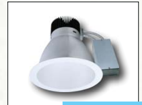
Can Retrofit Kit