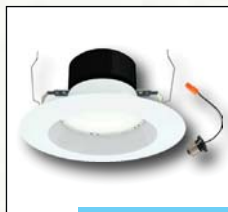
LED Can Retrofits