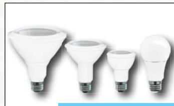
Universal Voltage LED Bulbs

In the hospitality industry, energy costs can be up to 60% of expenditures for a business. Considering that the lights need to be on 24/7 for guests and for safety, having energy efficient lighting is essential.