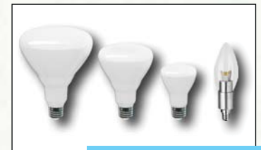
Dimmable LED Bulbs