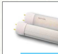
LED T8 Tubes