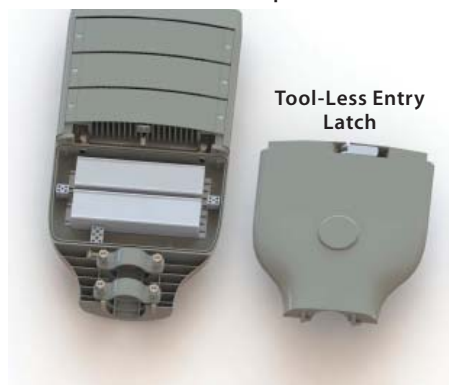
(2) Mounting Clamps (4) Stainless Steel Fastening Bolts

Accepts 1-1/4" - 2-3/4" O.D. Tenon or Pipe