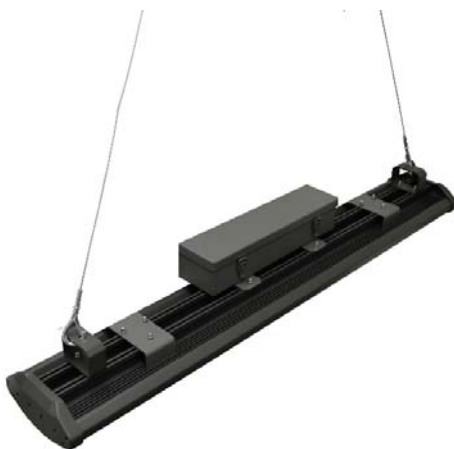
Hanging Mount Gripple Hangers Included